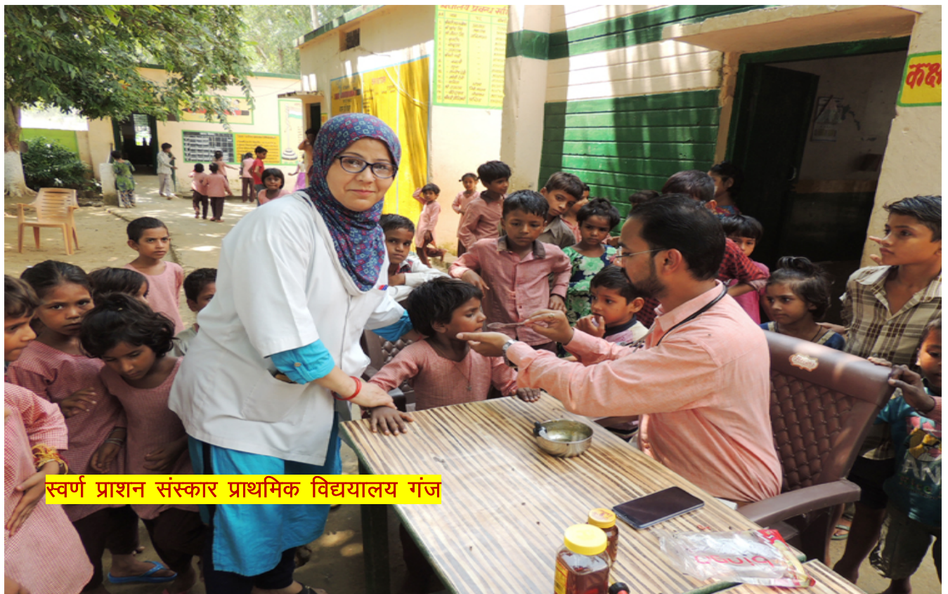
स्वर्ण प्राशन संस्कार प्राथमिक विद्यालय गंज