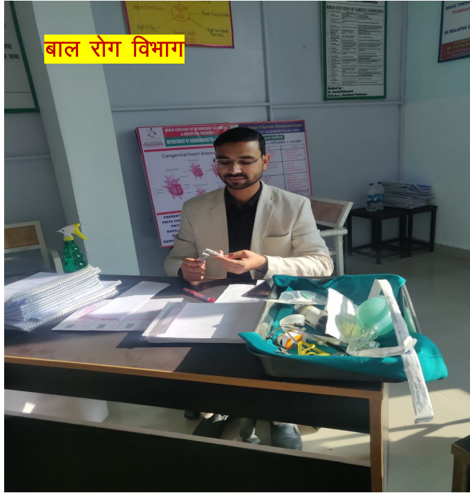
बाल रोग विभाग