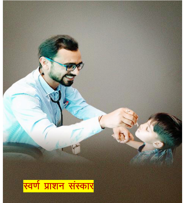
स्वर्ण प्राशन संस्कार